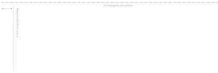
If Roses Grow In Heaven